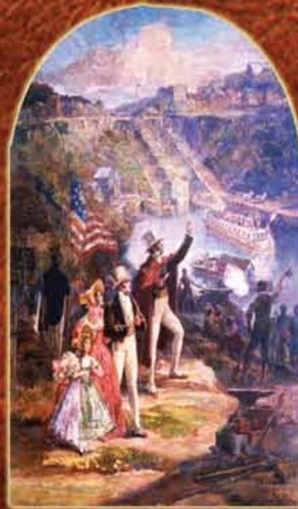
The mural entitled "The Opening of the Erie Canal, October 26, 1825", by Lockport artist A. Raphael Beck can be seen inside the Erie Canal Discovery Center, 24 Church Street, Lockport, NY.

The Locks at Lockport have been enlarged twice since the original ones were built. They were completed for the canal opening in 1825. Boats could haul 75 tons of freight. The locks for Clinton's Ditch were 90' long, 15' wide, and 4' deep. The canal was enlarged, starting in 1835 and was completed in 1862. The locks then measured 110' long, 18' wide, and 7' deep, making it possible for boats to carry up to 240 tons - a sizable increase. The Erie Canal as known today was enlarged between 1905 and 1917. The modern locks now measure 328' long, 45' wide, and a 12' depth of water over the lock sill. This permits boats of a maximum size of 300' long, 43' wide and 11' deep, carrying 2,000 tons of freight to use these new locks.