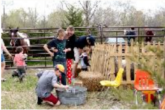
1st Autism Support Day, May 2019