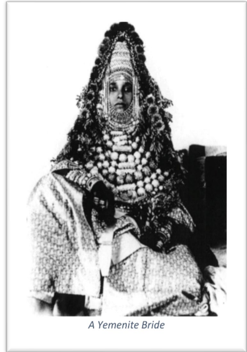
A Yemenite Bride

The family descends from the Jews of Southern India. The Jews of India descend from the Jews of Yemen. From about 100 B.C., Jews left the land of Israel for Yemen. The first synagogue was built there around that time. In 70 A.D., Titus destroyed Israel. More members of the Tribe of Judah, the Yehudi (Jews), escaped Israel. At this time, more Jews fled to the Yemenite-Jewish community in Saana. It became a thriving center of Jewish trade, art and religion.