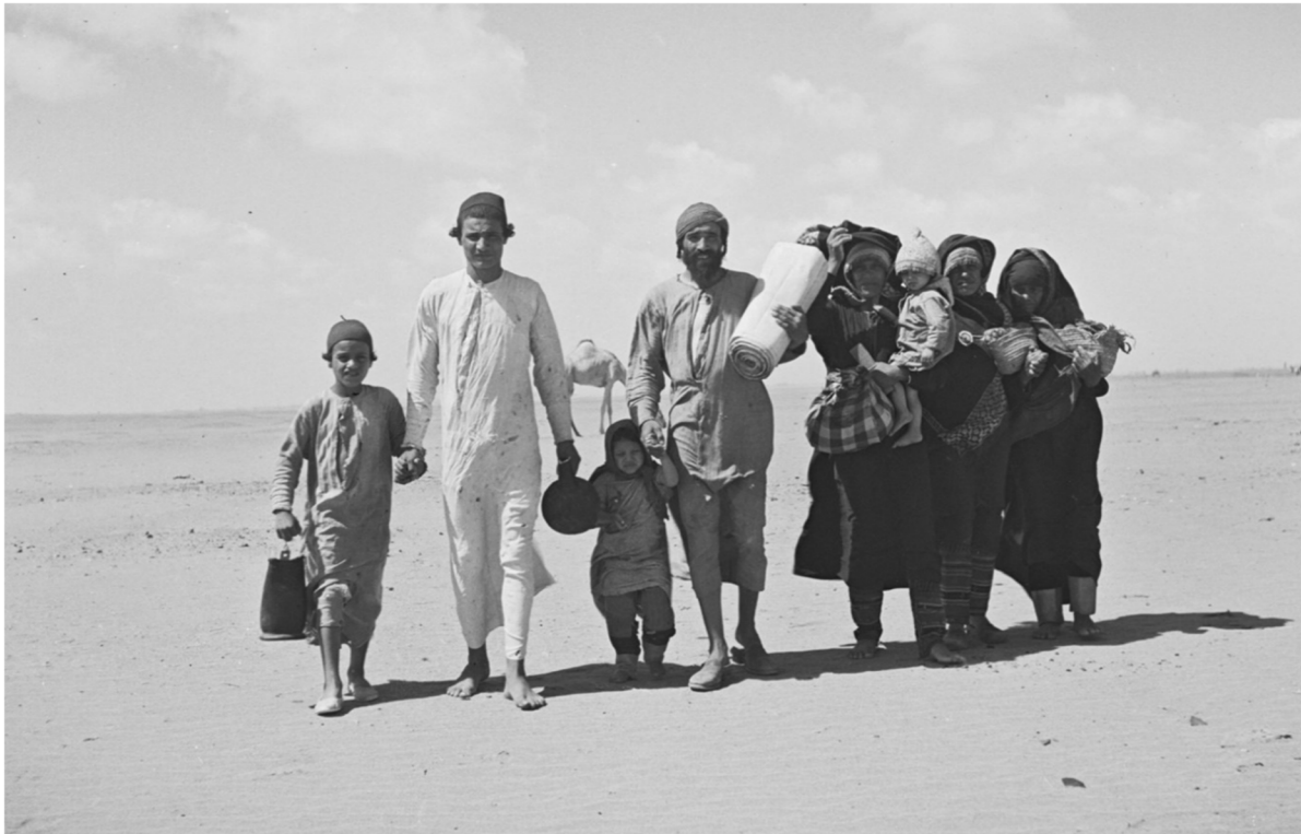
A Yemenite-Jewish Family