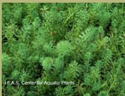
I.F.A.S. Center for Aquatic Plants