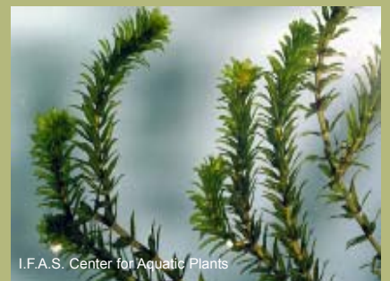
I.F.A.S. Center for Aquatic Plants