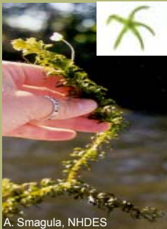
A. Smagula, NHDES