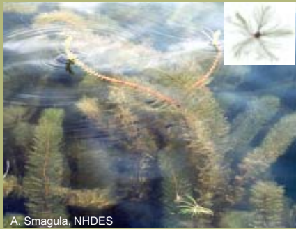
A. Smagula, NHDES