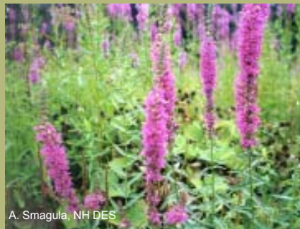
A. Smagula, NH DES