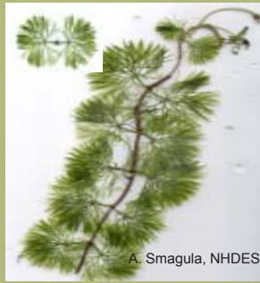
A. Smagula, NHDES