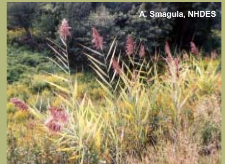
A. Smagula, NHDES