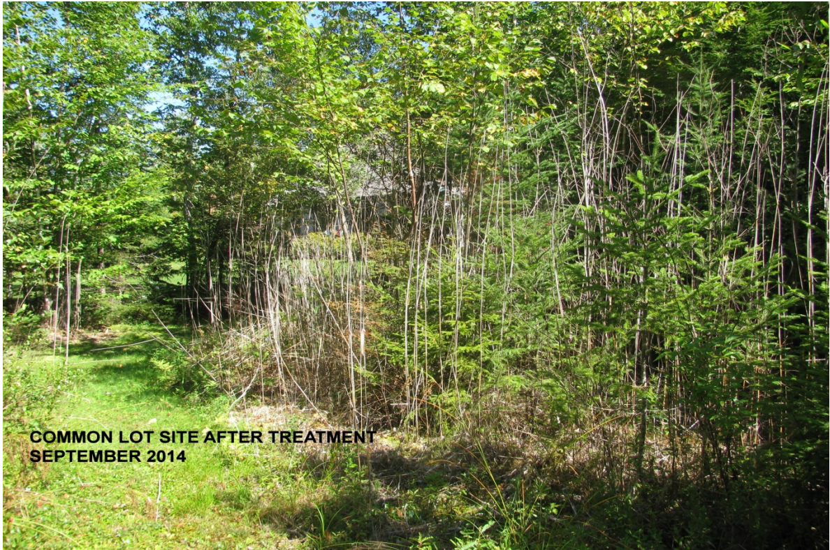
COMMON LOT SITE AFTER TREATMENT SEPTEMBER 2014