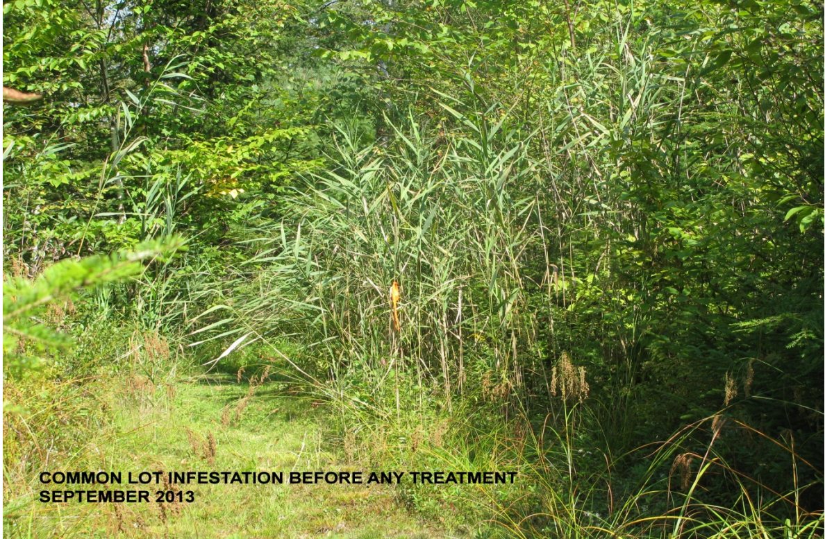
COMMON LOT INFESTATION BEFORE ANY TREATMENT SEPTEMBER 2013