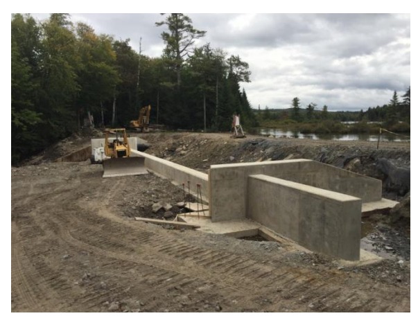
Dam construction in September 2018

We will be sending a letter to the State complimenting them on the work once they are completely done. The new concrete dam should last many years and we are thankful that the project has proceeded smoothly.