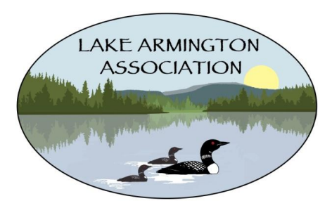
P.O. Box 143 Piermont, NH 03779 • www.lakearmington.org