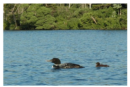
Loon and Chick

the lake around their docks and refers any questions to the Weed Watchers.