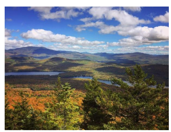
View from Piermont Mountain

This year's beautiful display of fall foliage in Piermont was a real treat, as was being able to swim into mid-September!