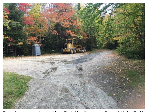
Erosion repair at the Public Access Road this Fall

We will continue to monitor the road with the Town.