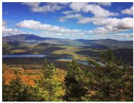
View of the lakes from Piermont Mountain

This year the Forest Service is beginning to develop a land use plan for the Lake Tarleton area, focusing on 3 major elements: recreation, forest management, and access control. The first step is to write an Environmental Assessment which will build on an Environmental Impact Statement which was written in 2006 (available online). A public meeting was held on November 21, 2019, in Warren, to start the public dialogue. LAA was well represented at this meeting. The Forest Service explained the process for developing the land use plan, and there were staff present to answer questions.