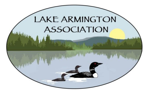
P.O. Box 143 Piermont, NH 03779 • www.lakearmington.org