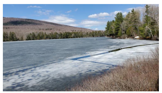
The lake on April 22 Earth Day just before Ice Out!

3^{rd} prize will go to Polly Tafrate at April 26^{th} at 1:00 PM