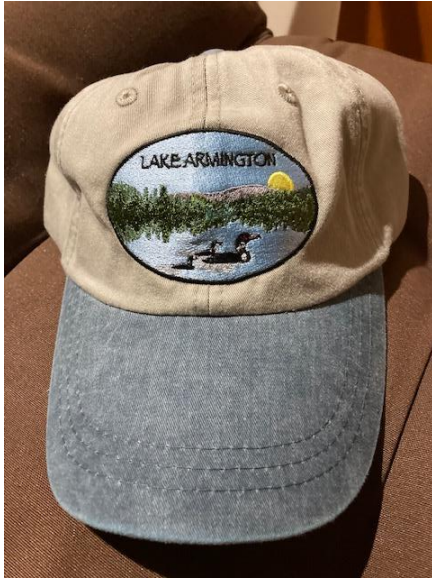
New Lake Armington hat

Now, we have a new batch of Lake Armington hats for sale, just in time for your holiday shopping.