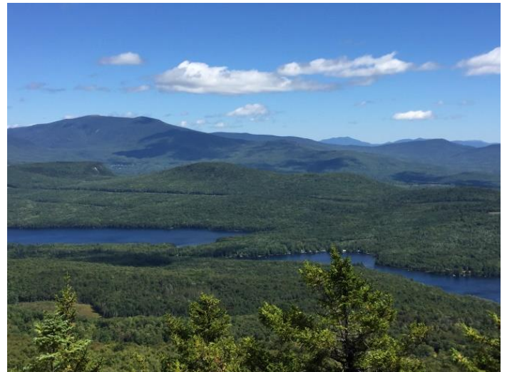
Lakes Armington and Tarleton from Piermont Mountain 2020