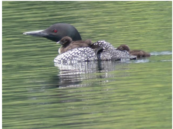
Loon with two chicks early in 2020 season