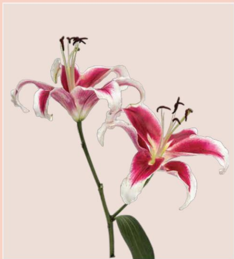
STEMS ARE HEAVIER