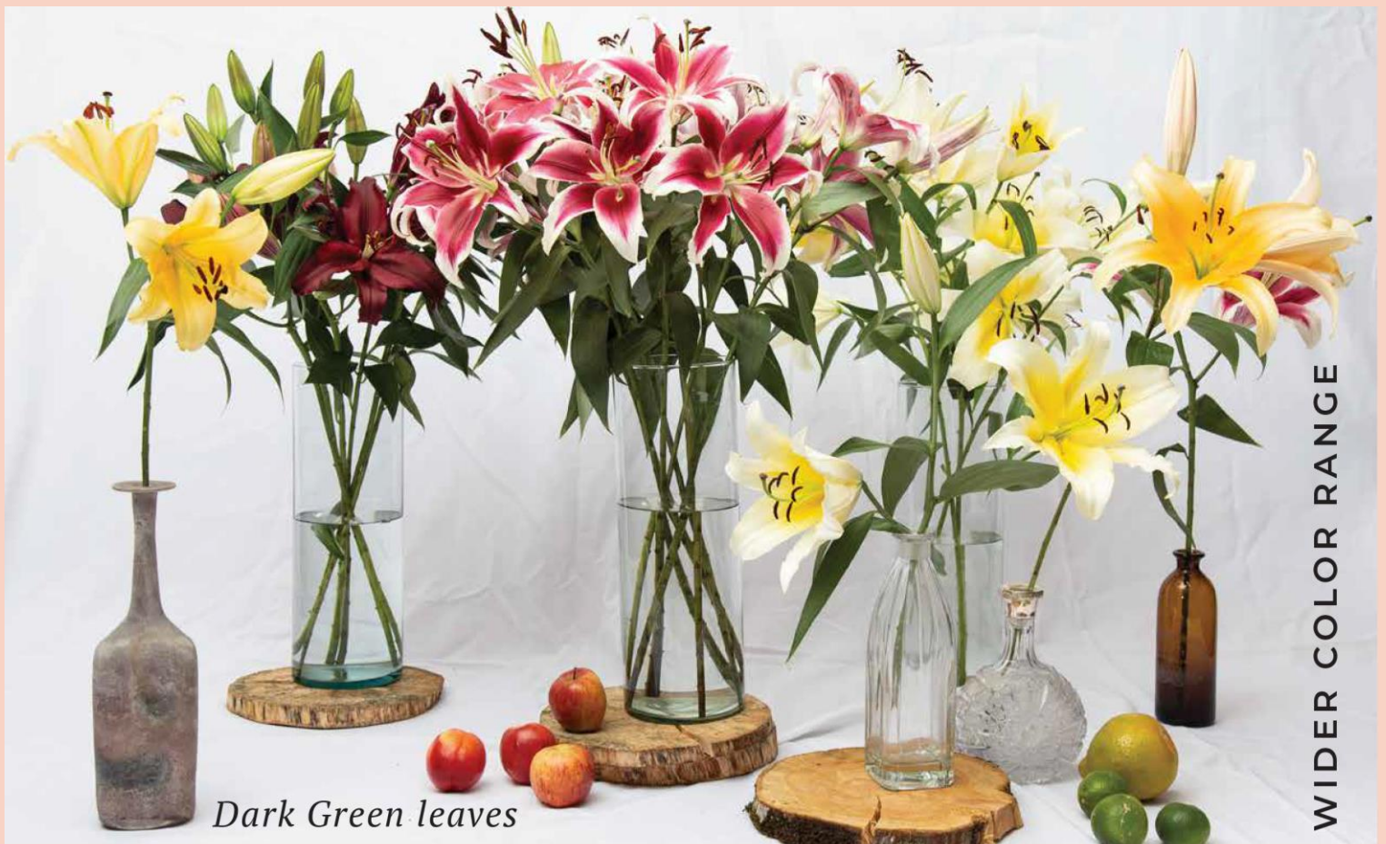
Dark Green leaves