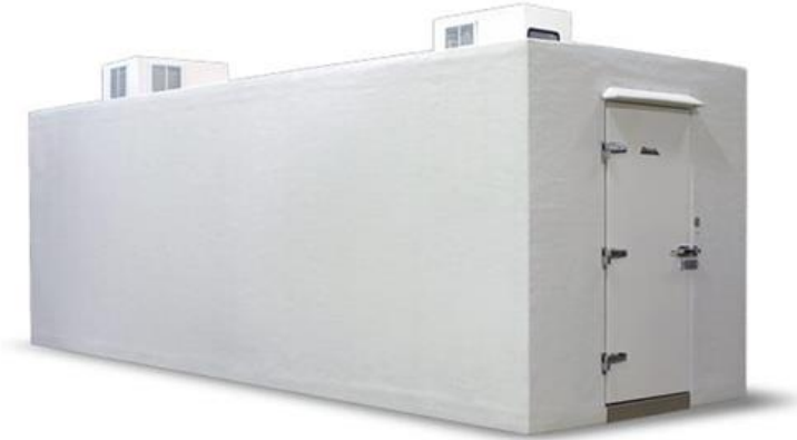
Cold Storage Prior 2020 (Dense)