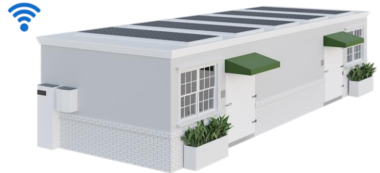
The Future of Cold Solutions (Last Mile)