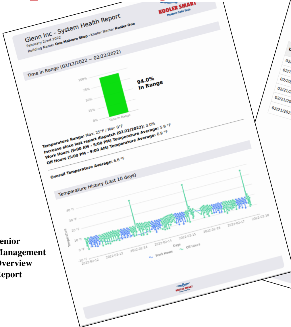
Senior Management Overview Report