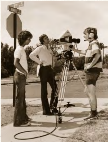
KAET Urbanscapes, 1977