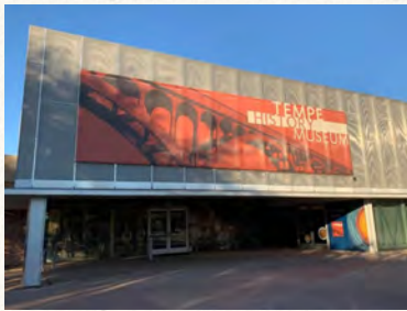
Tempe History Museum