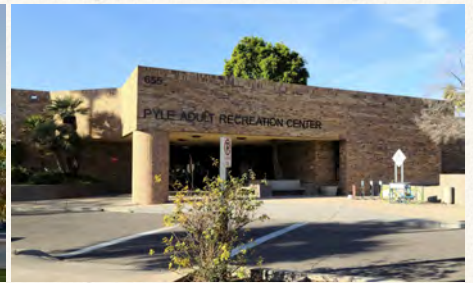
Pyle Adult Recreation Center