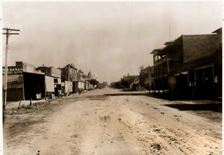
Looking south on Mill Avenue from 3rd street, Tempe ca.1900.