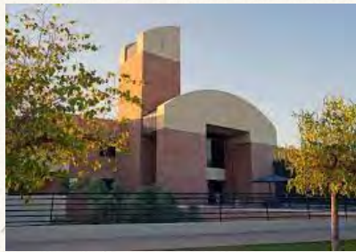
Tempe Public Library