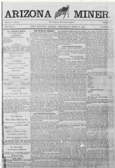
Arizona Miner newspaper