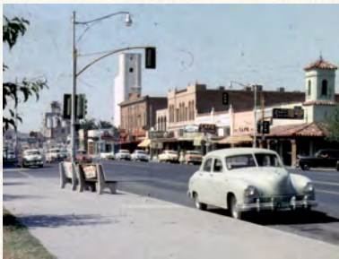
1956 street scene of Mill Avenue at 5th