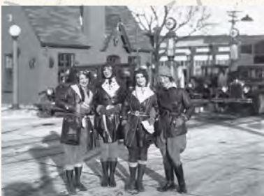
Women of 1920s take a gas station break along historic Route 66.

Marshall Trimble , Arizona's Official State Historian