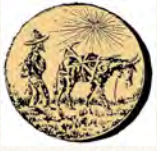
Mining & Minerals Education Foundation