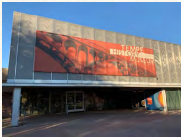
Tempe History Museum