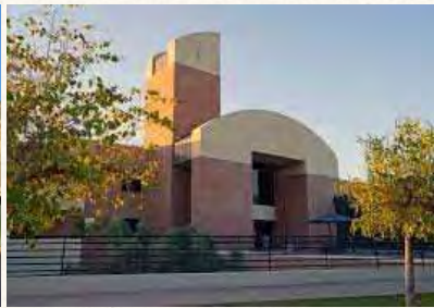
Tempe Public Library