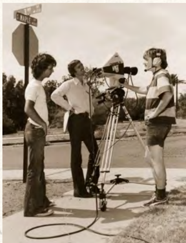
KAET Urbanscapes, 1977