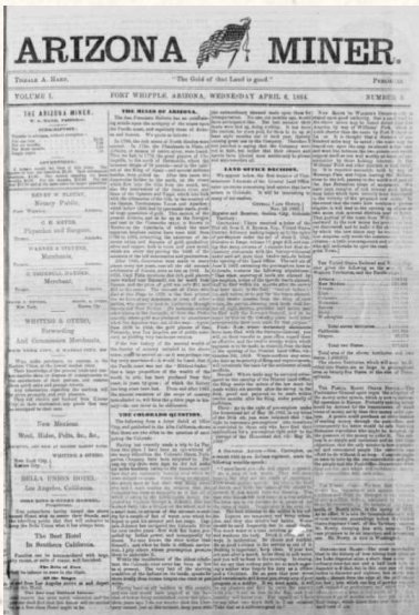
Arizona Miner newspaper