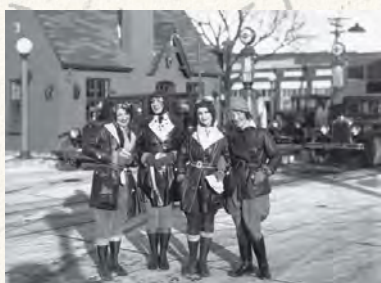
Women of 1920s take a gas station break along historic Route 66.

Marshall Trimble , Arizona's Official State Historian