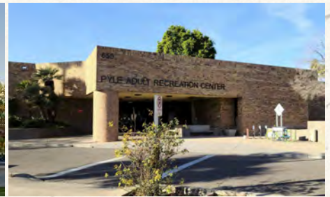
Pyle Adult Recreation Center