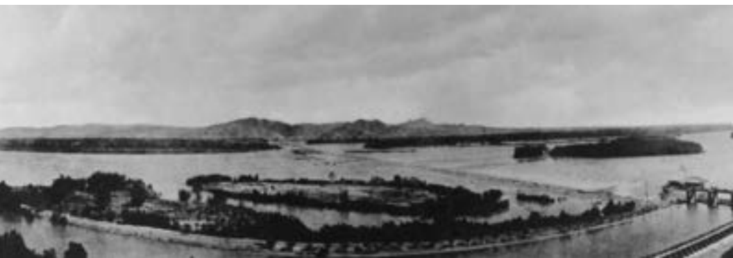
Yuma Projects Office Historical Photo 7-6 Laguna Dam; view of California sluiceway below the gates. March 24, 1909