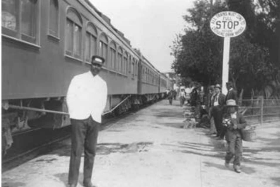
Yuma Projects Office Historical Photo 3-19 (11S-JAJ-742 Yuma Box ) Indians of Yuma selling their beadwork to the tourists as the trains enter the station at Yuma, Arizona; on the main line of the Southern Pacific. April 5, 1909 W.J.L.