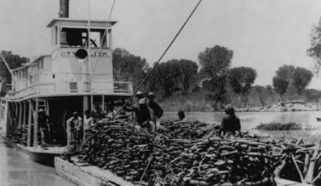
Yuma Projects Office Historical Photo 2-1 National Archives Photo 11S-JI-98 HP-400-49D IMPERIAL PROJECT, CALIFORNIA View showing the steamboat St. Vallier with crew at Heading No.3 of the Imperial Canal, Mexico, preparing to dam off the third heading or intake of the Imperial Canal during the high water of the Colorado River. June 1, 1905. Photographer W.J.L.