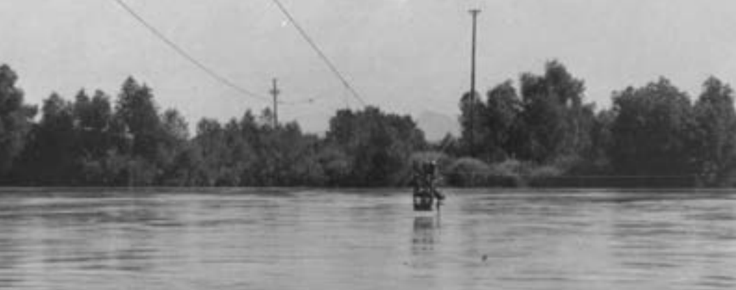
Yuma Projects Office Historical Photo 17- 20

Making gaging of Colorado River at Yuma station. Gage height 31 feet, discharge 182,000 cubic feet per second. Note man in car leaning out with hand in water. June 27, 1921