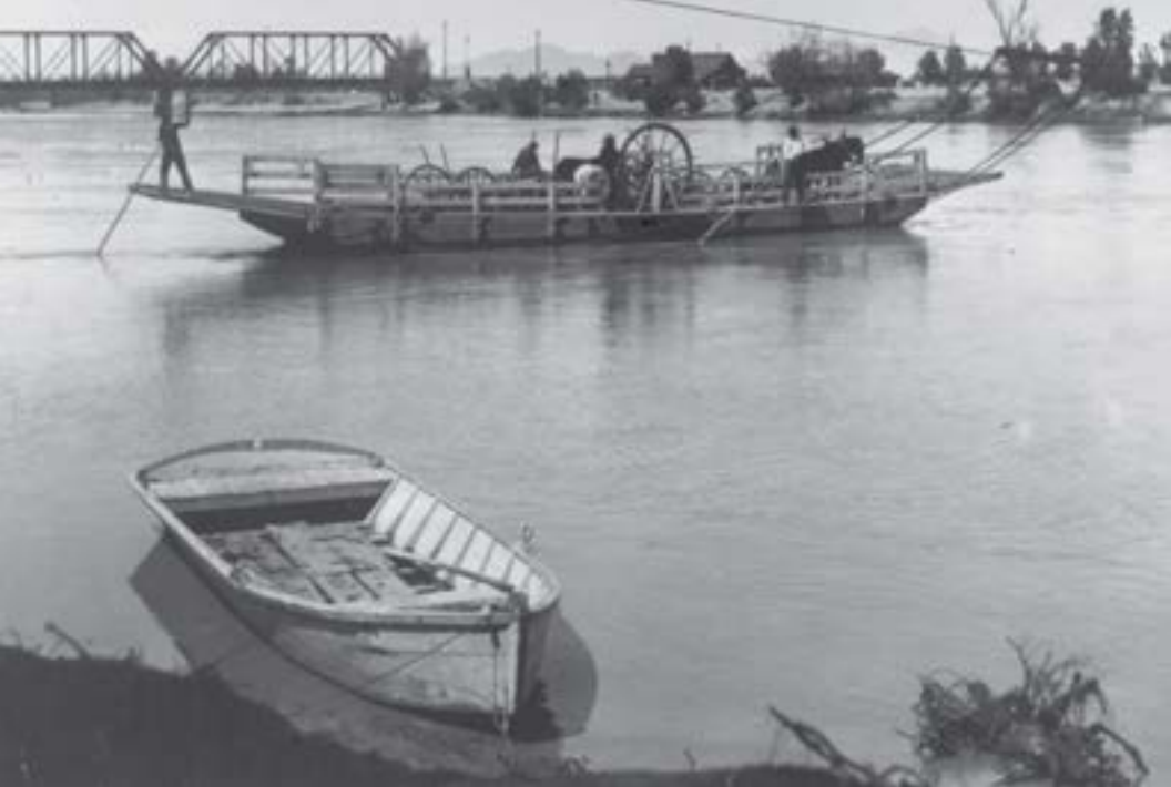
Yuma Projects Office Historical Photo 14 National Archives Photo (11S-JAJ-732) Ferry at Yuma Crossing, April 5, 1909