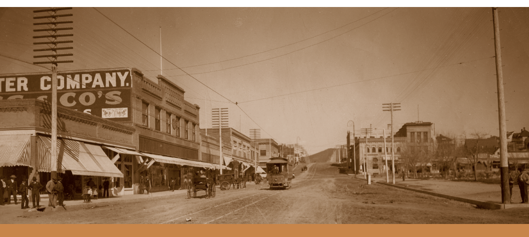
Street car and horse buggies on Gurley St., ca.1905.

Cover: 1939 Prescott Frontier Days parade.