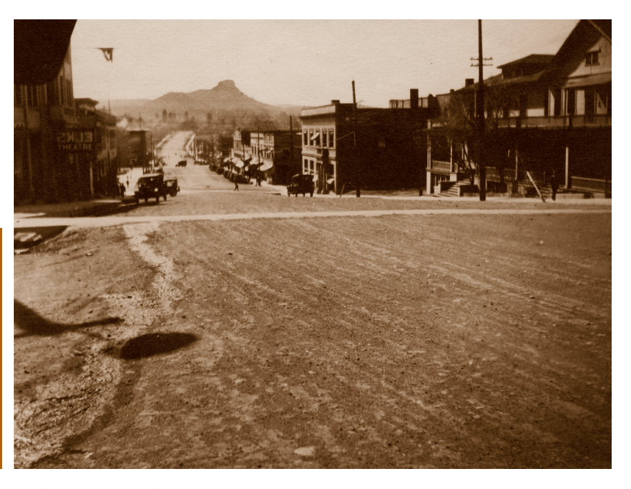
Looking west on Gurley St., ca. 1915.

Location: Clarkdale/Cottonwood Ballroom.