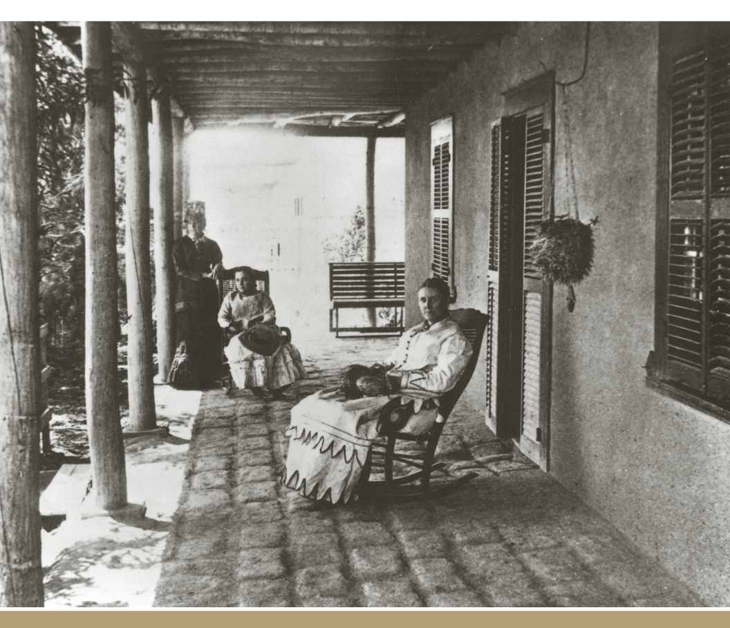
Sanguinetti House, 1880s. AHS #60348.