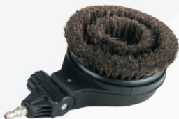
Rotating brush with hinge 1000-03-119