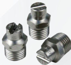
Nozzles set (3pcs) 1000-03-114