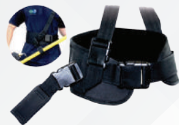
Belt support for SpearJet Pole 1000-03-118

* The Turbonozzle addresses the constraints of the zero-degree tip effectively. While the zero-degree tip generates intense pressure, its focused stream lacks coverage for effective cleaning. The Turbonozzle tackles this by spinning the zero-degree water stream in a 20-degree circle, combining the high impact with better cleaning coverage. Compared to a standard fan nozzle, the Turbonozzle enhances cleaning efficiency by at least 50%, offering both powerful impact and improved cleaning reach.