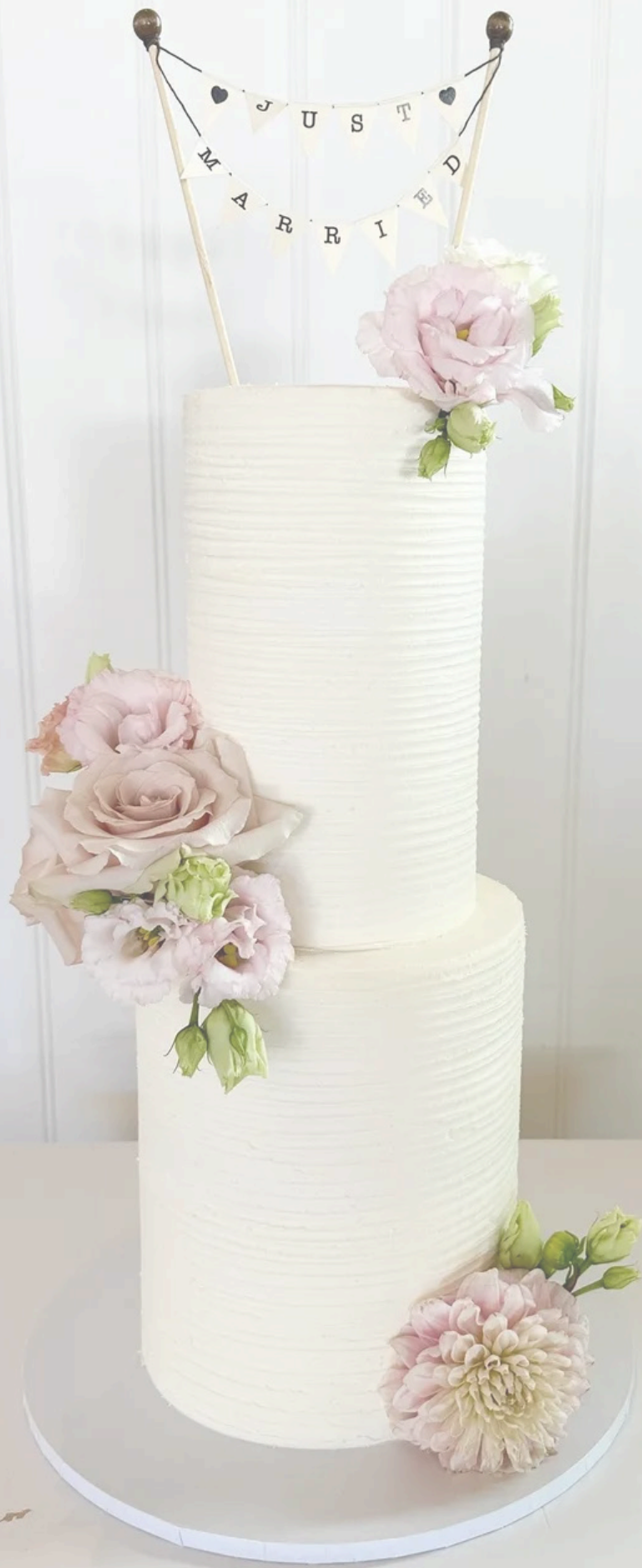
Signature Wedding Cake Range