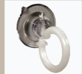
BO8000 – 1 1/2" diameter Suction Cup