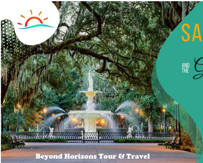
Beyond Horizons Tour & Travel