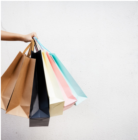
Spring Stroll & Shop in Baldwinsville NY taking place from 4/10 - 5/8

Homes are selling fast in the CNY real estate market