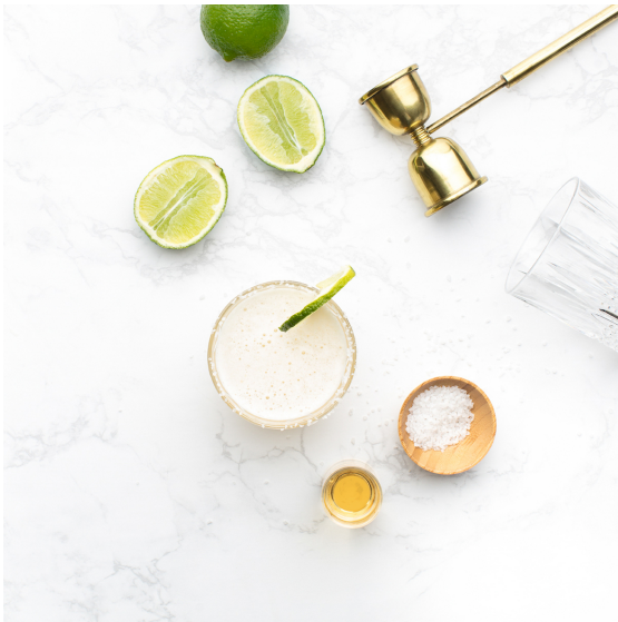
Baldwinsville Margaritafest July 17th from 12-5pm

BBQ and firing up the grill! Experts say the key to a successful outdoor meal is ensuring your grill is clean and pre-heated before you begin cooking.