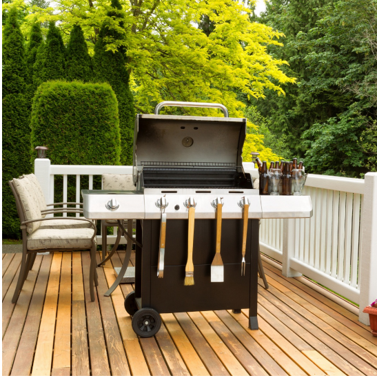
July is National Grilling Month

BBQ and firing up the grill! Experts say the key to a successful outdoor meal is ensuring your grill is clean and pre-heated before you begin cooking.