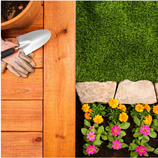
Spring Home Prep

As Spring approaches, now is the perfect time to get your home ready. Make a list of what home projects and repairs you would like to do when the weather officially changes. Don't forget to trim any branches or shrubs, check your gutters, and order a new filter for your HVAC system!