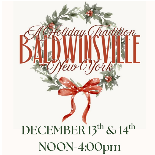
Baldwinsville Holiday Village Tradition