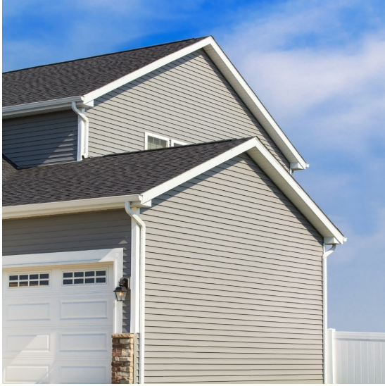
April is a great time to clean your gutters

April is the perfect time for spring cleaning, gardening, and enjoying the warmer weather. It's also the perfect time to clean out all the debris in your gutters that has collected over the fall and winter! Don't wait until you have a problem, preventative maintenance is always the best option!