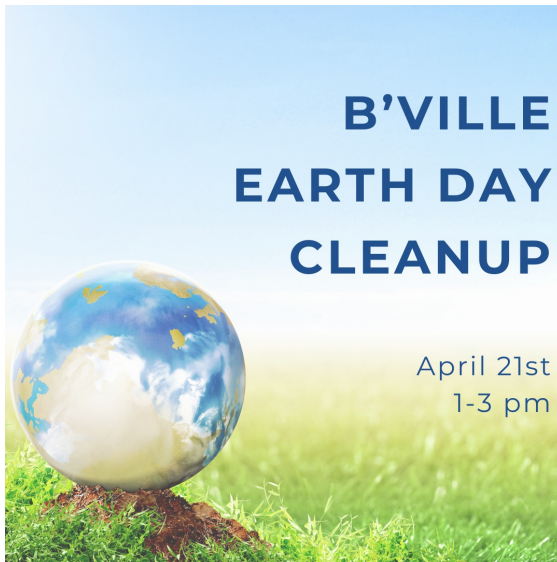
B'Ville Earth Day Clean Up

April is the perfect time for spring cleaning, gardening, and enjoying the warmer weather. It's also the perfect time to clean out all the debris in your gutters that has collected over the fall and winter! Don't wait until you have a problem, preventative maintenance is always the best option!