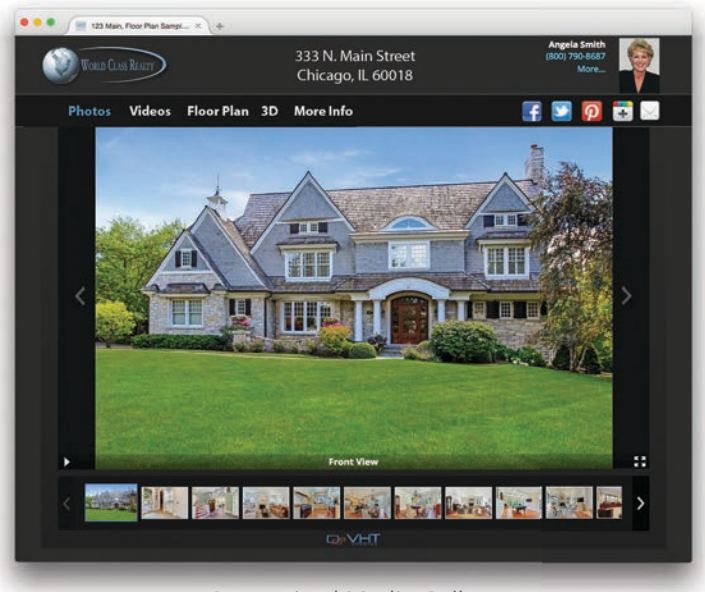
Customized Media Gallery