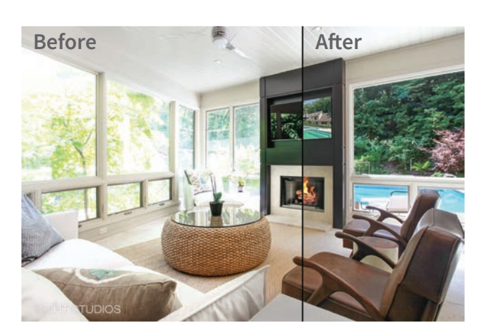
CLEARSHOT™ Technology, Fire Added and TV Enhancements