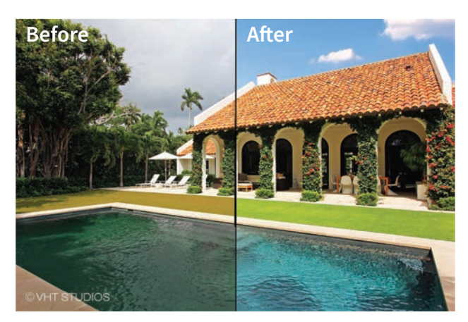
Blue Sky, Green Grass and Pool Enhancements