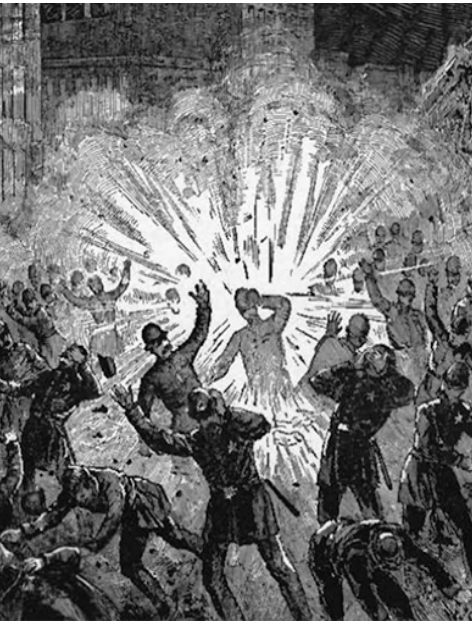
THE HAYMARKET MASSACRE, 1886

The Haymarket Affair uplifted the eight hour workday to the forefront of political issues, and after decades of more radical union action, the labor movement eventually succeeded in winning workers weekend and overtime rights in the 1938 Fair Labor Standards Act. Today, May Day is a day of remembrance, celebration, and appreciation for the martyrs of the class war, as well as current workers who share their dream of a world where labor is entitled to all it produces. ■