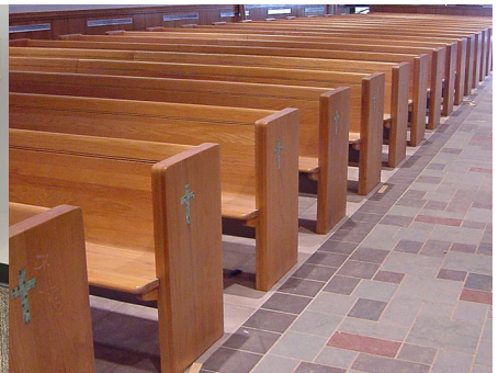
Community Baptist Church Ankeny and St. Theresa Catholic Church Des Moines find Jesus with the help of prison labor.