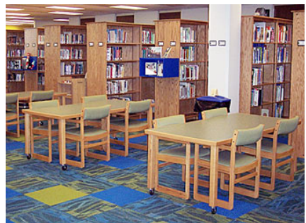
UNI dorm room and library brought to you by prison labor!