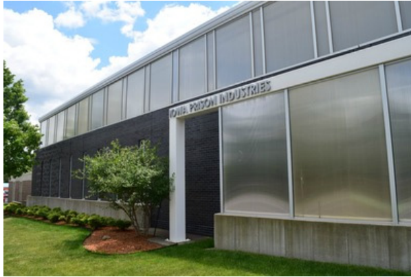
IPI's headquarters are on the east side of Des Moines