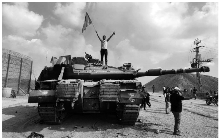
From The River To The Sea "Decolonization is always a violent event" Franz Fanon - "The Wretched of the Earth", 1961 Subcomandante Iade & Subcomandante Ronnie

Most western writing about the current battle in Palestine presupposes that the state of Israel is legitimate, occasionally mentioning contested settlements as disagreements among neighbors.