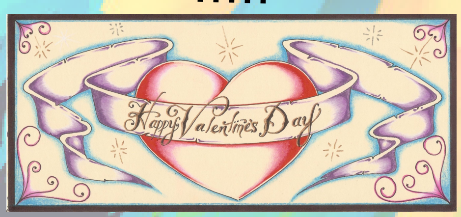
Art by "Skid"

On top of this there is at least one juvenile lifer that was only in prison for fifteen years and was released to ICE from Newton. I don't know if this has something to do with that institution specifically, but it seems odd to me that I am supposed to be looked at as an individual, but in terms of how much time I have to complete before given a chance to be released, I am being measure against all the other juvenile lifers. The only reason I have been given as to why I have to do more time is because the "average" of all the rest of the juvenile lifers is around 23 years before they went to minimum. So I am an individual when it is convenient for this place to make me one, but in terms of my time in prison, I am not. It would seem that the message that is being given is that it does not matter how the time is done, only that it is done.