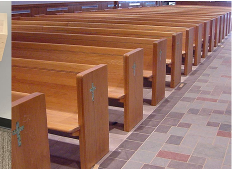
Community Baptist Church Ankeny and St. Theresa Catholic Church Des Moines find Jesus with the help of prison labor.