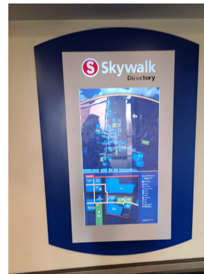
City of Des Moines Skywalk signage also brought to us by prison labor