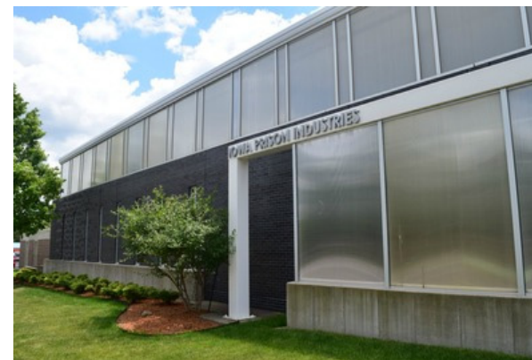
IPI's headquarters are on the east side of Des Moines