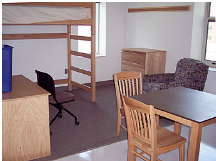
UNI dorm room and library brought to you by prison labor!