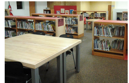
North Liberty Public Library furniture by IPI workers