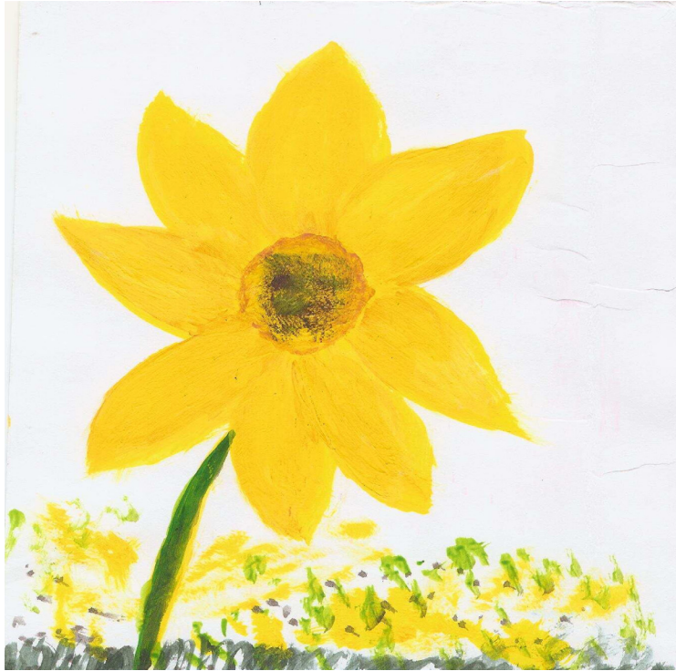
Art by Sofields