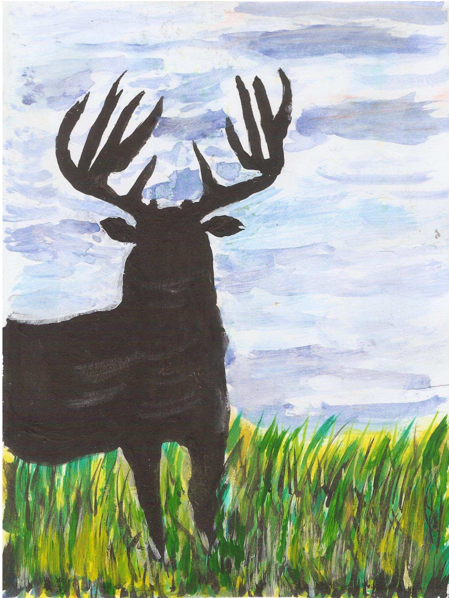
Art by Sofields