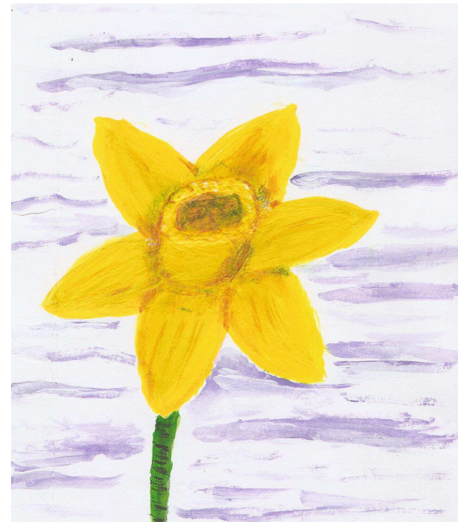
Art by Sofields

Don't let death be the reason the community stands for those who are being mistreated in the hands of a crooked system.