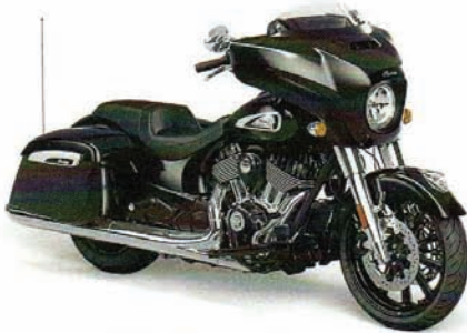
2024 Indian Chieftain