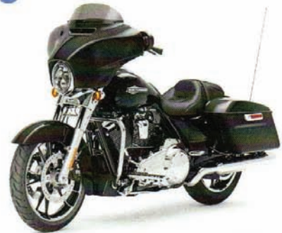
2024 Harley Davidson Street Glide

First Prize: 2024 Indian Chieftain or Harley Davidson