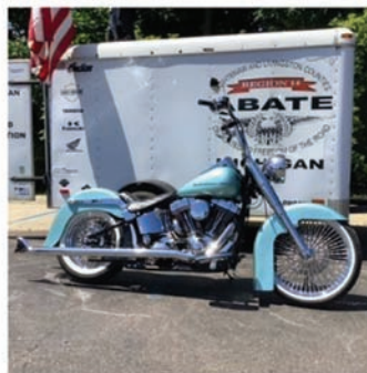
Kevin - Best of Show