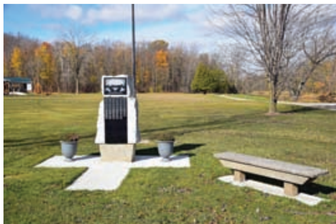
Region 7 Monument with cement work done around it