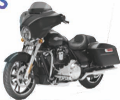
2023 Harley Davidson Street Glide

First Prize: 2023 Indian Chieftain or Harley Davidson