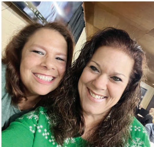
Regions - 18, 14 & 15 Christmas Party and Chili Cook off