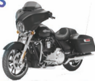
2023 Harley Davidson Street Glide

First Prize: 2023 Indian Chieftain or Harley Davidson