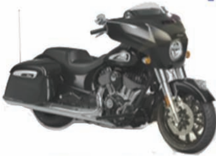
2023 Indian Chieftain