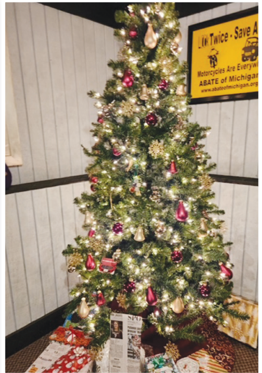
The present tree