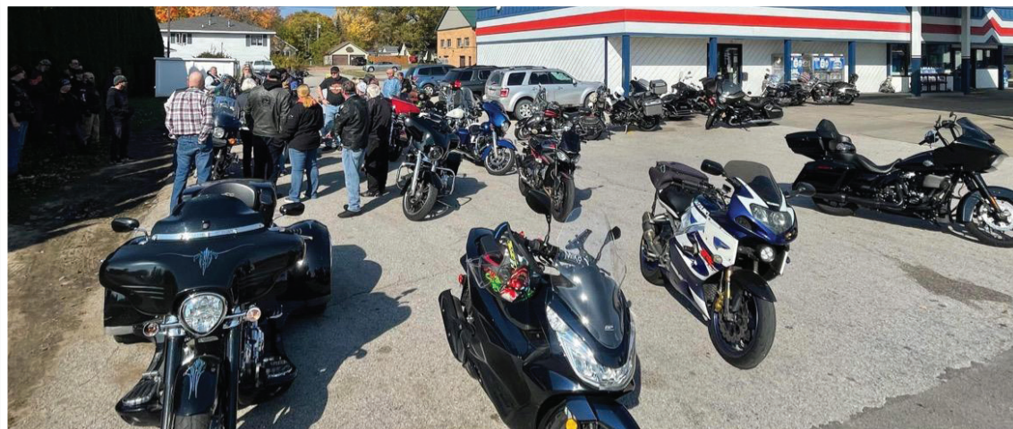
Region 8 Color Ride