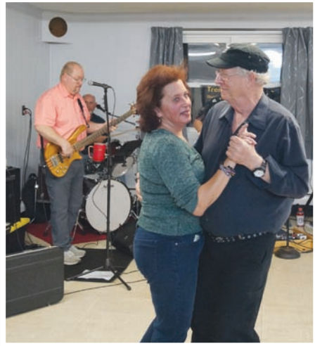
Region 3 Christmas Party at Central Lake Am-Vets Building