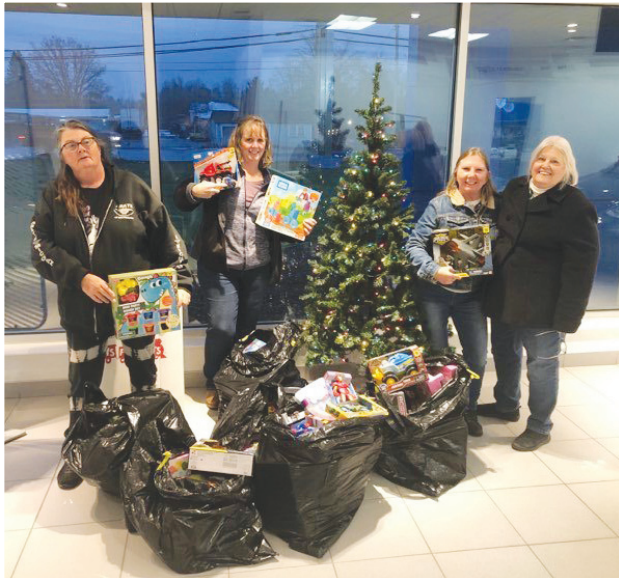
Region 3 girls with all their goodies for the Toys for Tots drive.