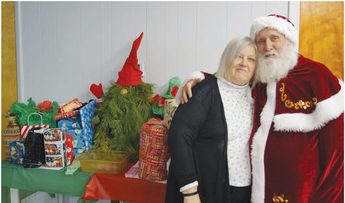
Region 3's Christmas Party at Central Lake Am-Vets