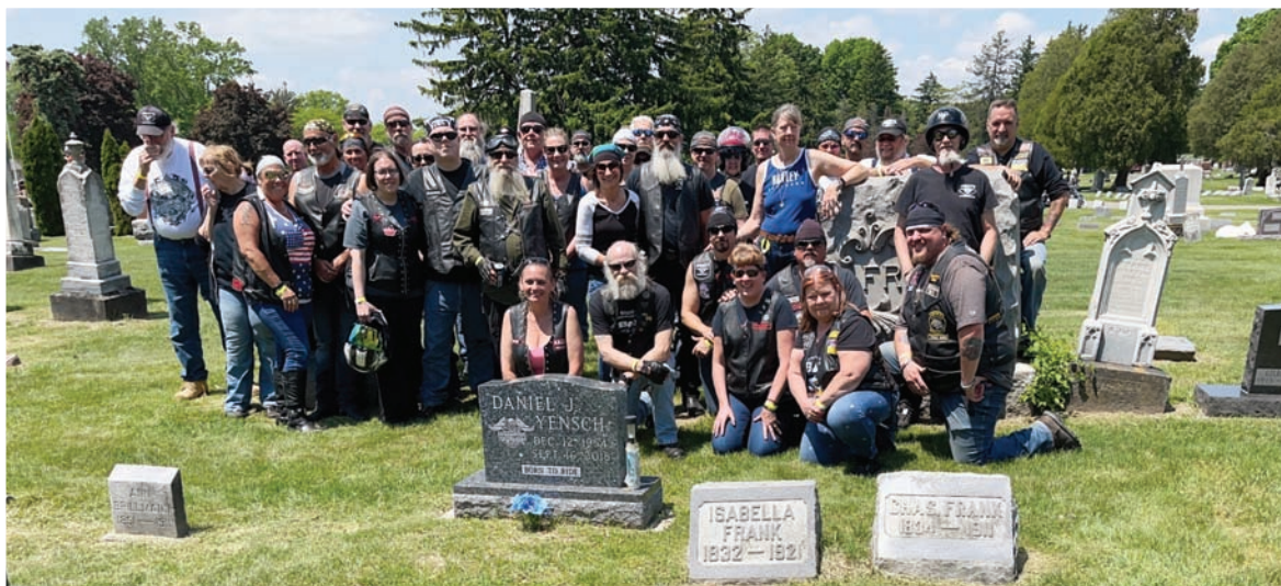
Region 18 ~ Memorial run to honor those lost in motorcycle accidents and in the line of duty.