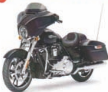
2025 Harley Davidson Street Glide

First Prize: 2025 Indian Chieftain or Harley Davidson