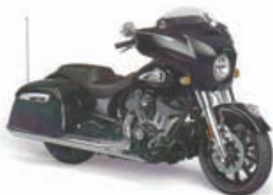
2025 Indian Chieftain