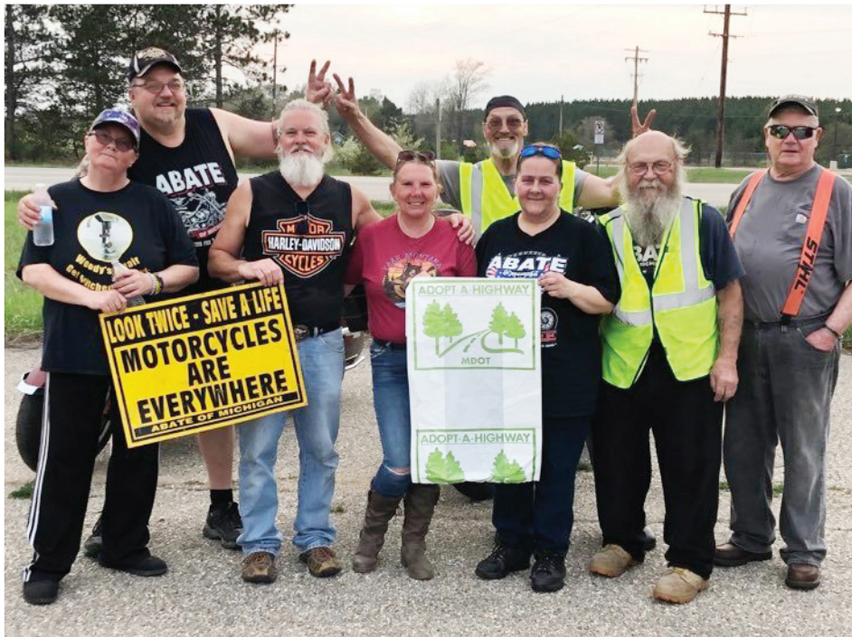
Region 3 - semi annual road clean up