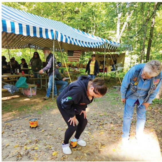
Region 7 Duck Drop