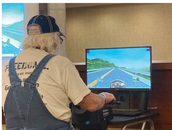
Butch taking a ride on the simulator!