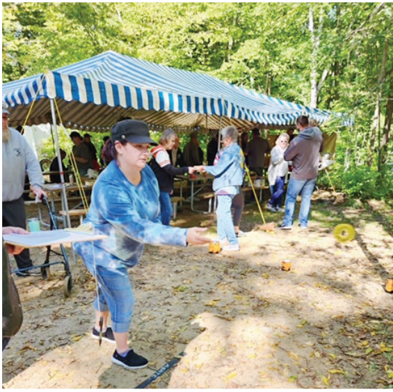
Region 7 Washer Toss