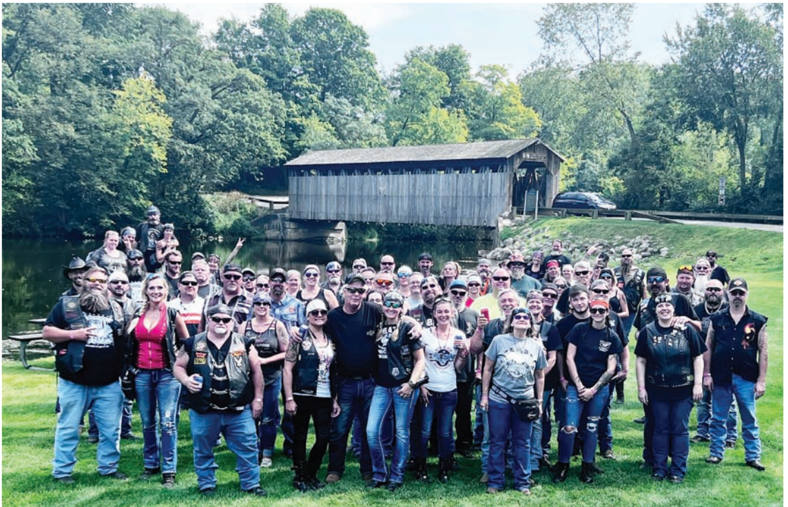
Region 10 - End of the Summer Ride in September - taken at Fallasburg Covered Bridge