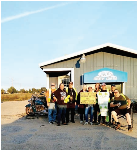
Region 3 fall road cleanup crew. It was a great day to help our community keeping the roadsides clear of debris.