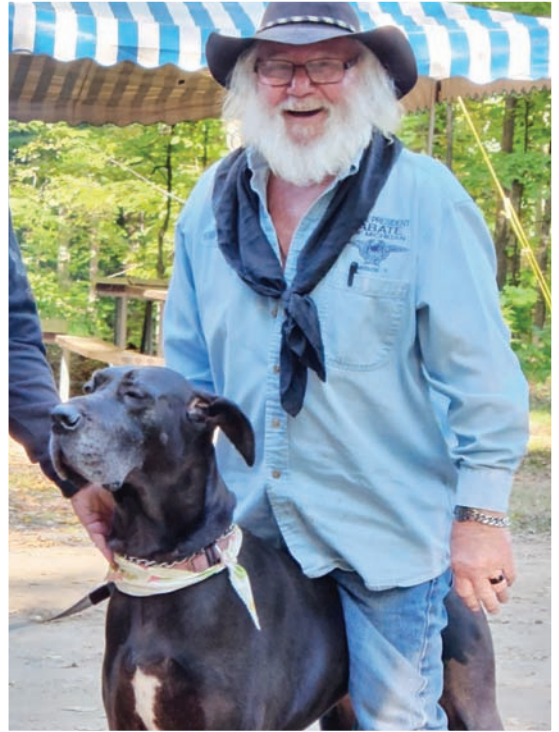
Butch s New Ride