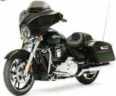
2024 Harley Davidson Street Glide

First Prize: 2024 Indian Chieftain or Harley Davidson