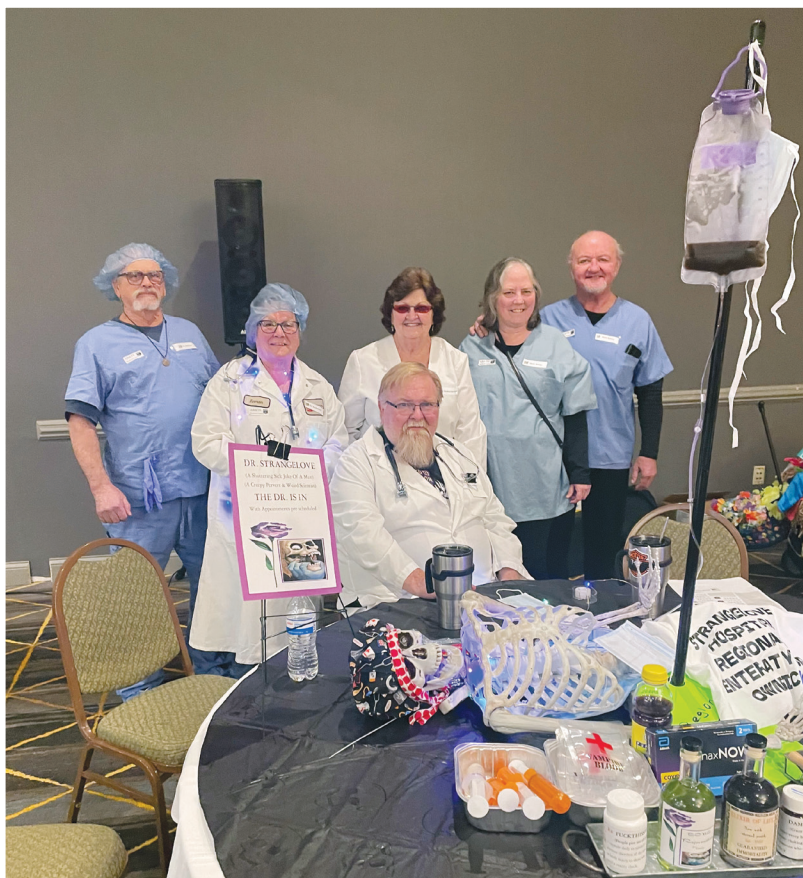
Region 6 fixing u right up!!