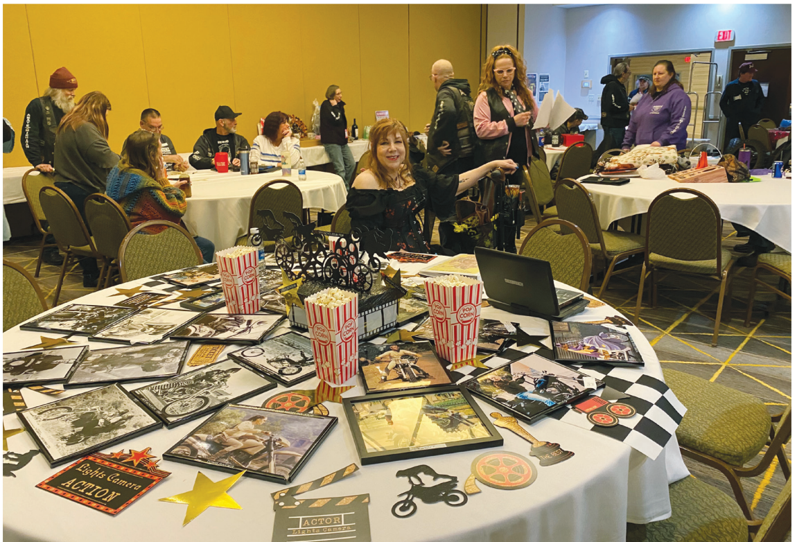
Region 14 table top decorations