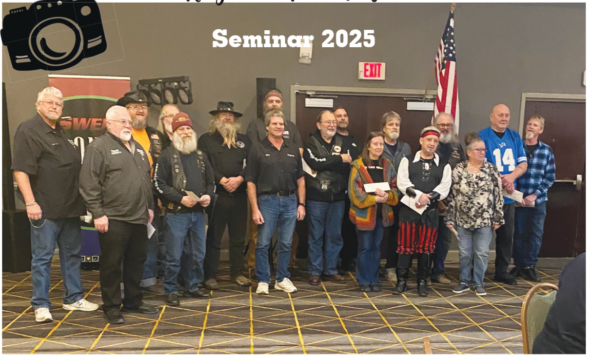
RC's with the president at the 2025