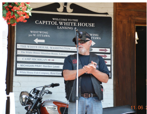
Region Event photos are on pages 30 & 31