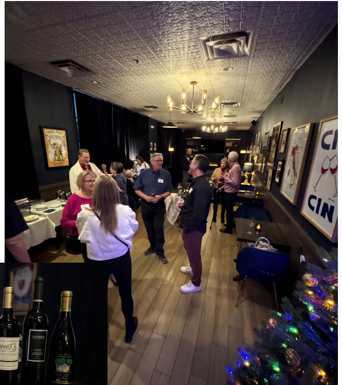
We had a full house!