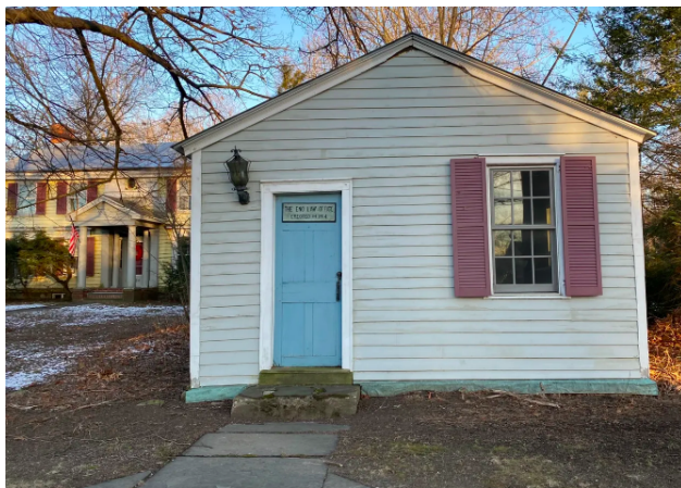
The Eno Law Office in Pine Plains

NEW YORK, N.Y. - The oldest, free-standing law office building in New York is The Eno Law Office, a little-known privately owned museum in Pine Plains, Dutchess County. Some of its papers date back to the American Revolution. Stephen Eno (1764-1854), a one-time Dutchess County Clerk, was admitted to practice law in 1795. He opened the two-room office in 1814.