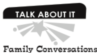
Figure out a way to have mealtimes be a reminder that it is Lent. Perhaps you'll use Lent's colour (purple) and use purple napkins, serve purple grape juice, or use a purple tablecloth. Maybe you'll read a short Bible story together before you eat. Perhaps you'll use a different grace. Find something easy to mark this church season in your home.