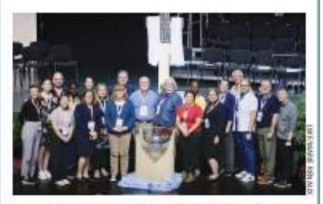
ELCIC members contributed in a variety of ways at the 13th Assembly of The Lutheran World Federation, in Krakow, Poland, September 2023.