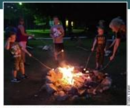
Sharing a campfire at Camp Lutherlyn.