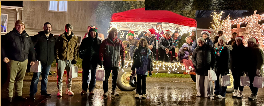
light up Lincoln parade