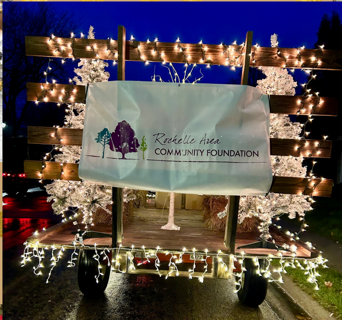
letters to Santa