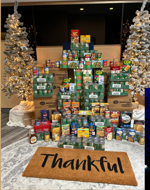
canned food drive