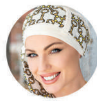
YANNA White Golden Chain