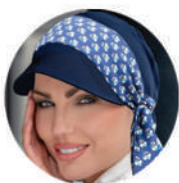
Navy Iris Florenza