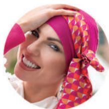
YANNA Purple Golden Allure