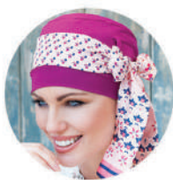
YANNA Purple Blush Florenza