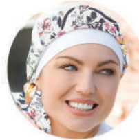
YANNA White Summertime