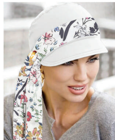
KATIA PLUS White Summertime