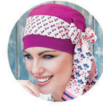
YANNA Purple Blush Florenza