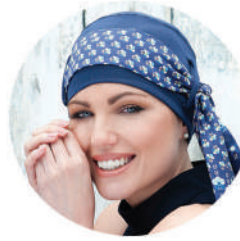
YANNA Navy Iris Florenza