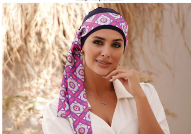
YANNA Navy Purple Rose