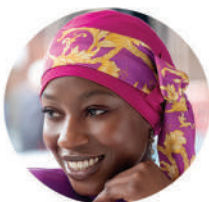
YANNA Purple Royal Gold