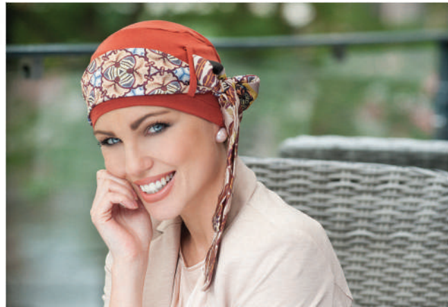
YANNA Brick Cinnamon Alloro