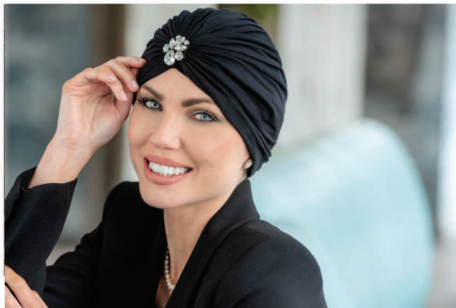
Celine Black White Diamond