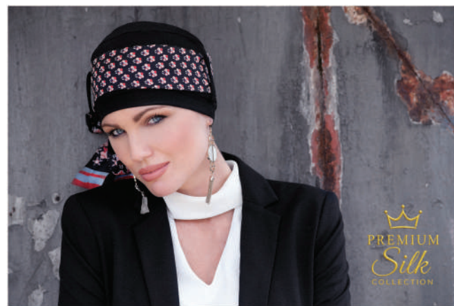
YANNA Silk Black Scarlet Florenza