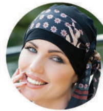
YANNA Black Blush Fiori