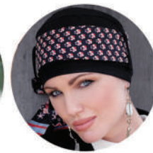
YANNA Black Scarlett Firenze