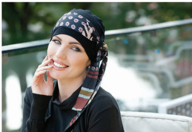
YANNA Black Blush Fiori