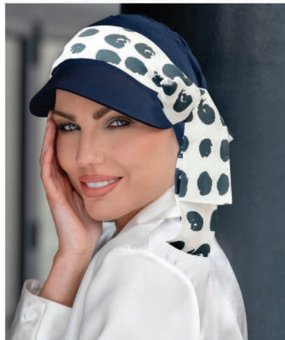
KATIA PLUS Navy White Polka Dot