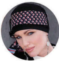
YANNA Black Scarlett Florenza