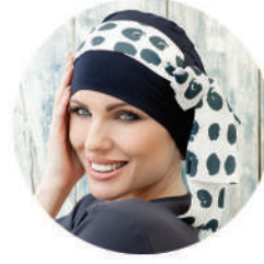
YANNA Navy White Polka Dot