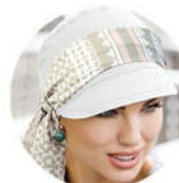
White Green Aloe