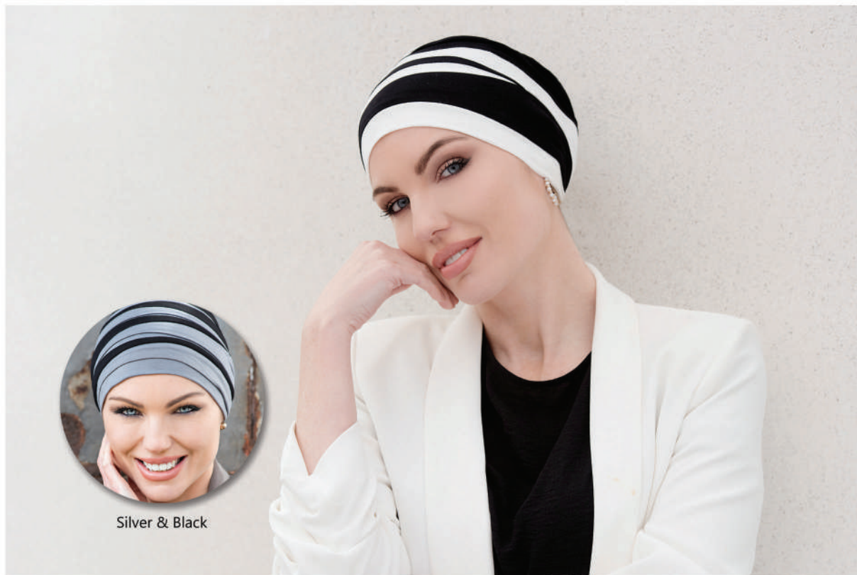
Silver & Black