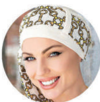
YANNA White Golden Chain