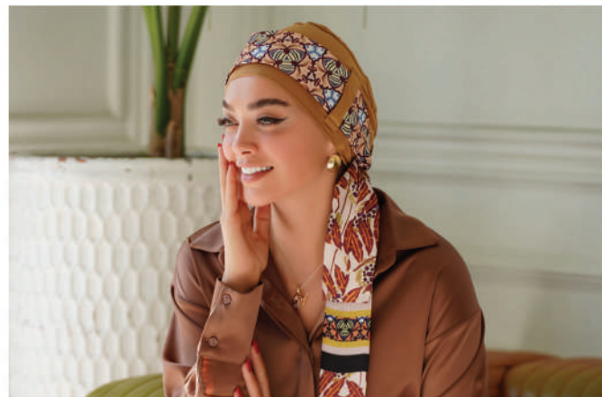
YANNA Camel Cinnamon Alloro