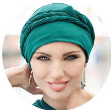
ASHA LOOK | 2 Green Forest