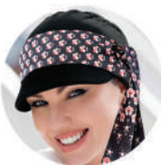
Black Scarlet Florenza