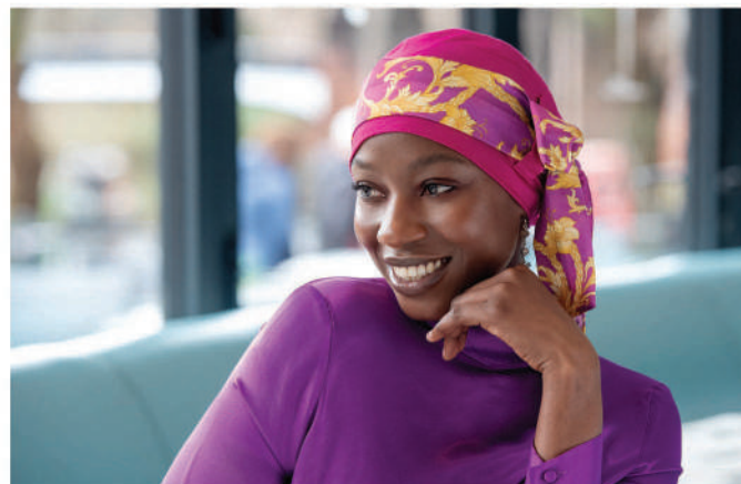
YANNA Purple Royal Gold