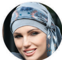
YANNA Grey Velvet Blu Fiori