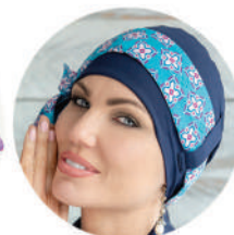
YANNA Navy Sky Flora