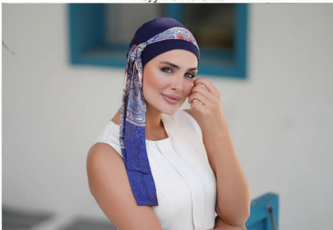
YANNA Navy Mosaica Linea