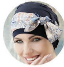
YANNA Navy Mosaica Linea