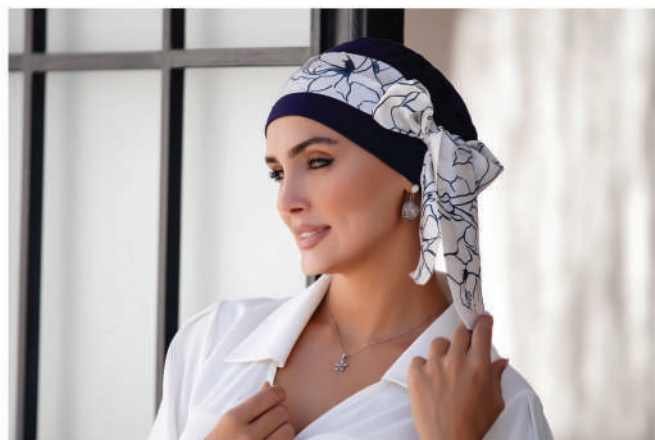
YANNA Navy White Lilium