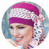
YANNA Purple Blush Firenze