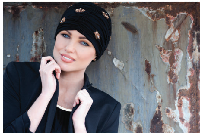
DIAMOND Black Golden Shell