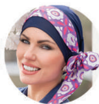
YANNA Navy Purple Rose