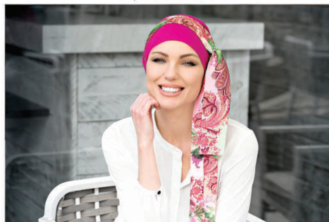
YANNA Purple Royal Fuchsia