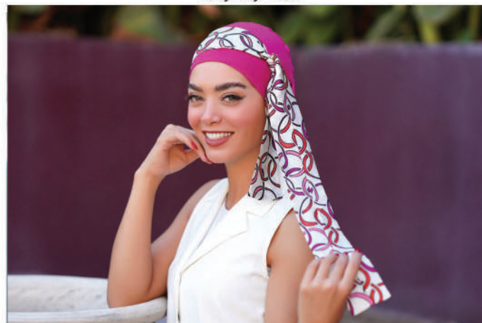
YANNA Purple Cerchio Elegant