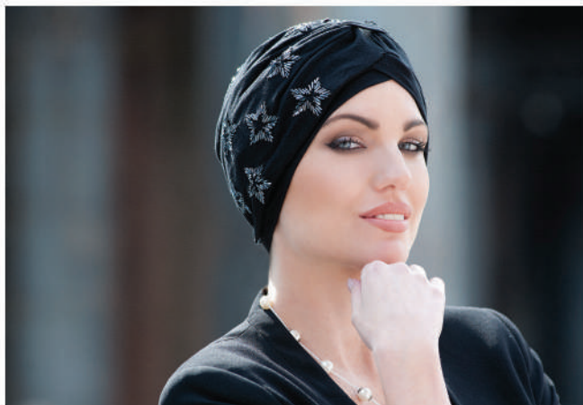
STAR Black Beryl