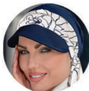
Navy White Lilium