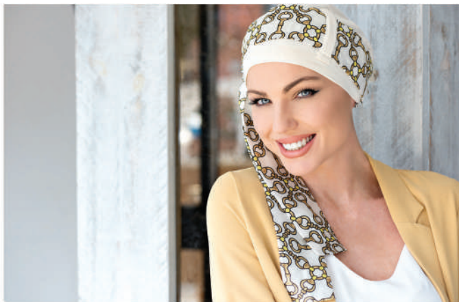
YANNA White Golden Chain