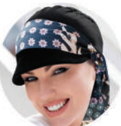
Black Blush Fiori