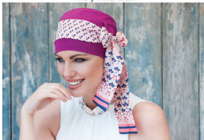
YANNA Purple Blush Florenza