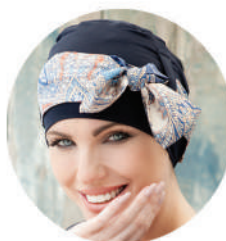
YANNA Navy Mosaica Linea