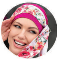
YANNA Purple Camellia