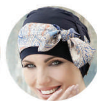
YANNA Navy Mosaica Linea