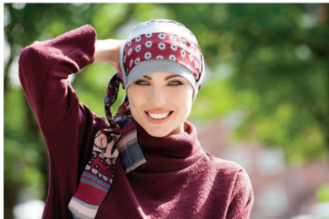
YANNA Grey Maroon Fiori