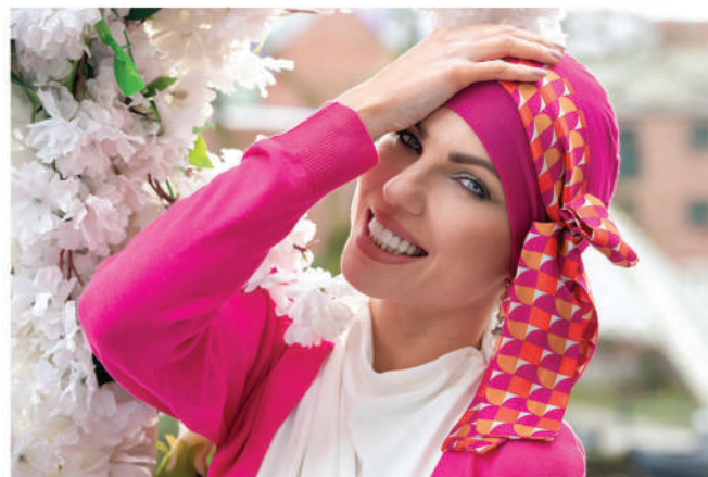
YANNA Purple Golden Allure