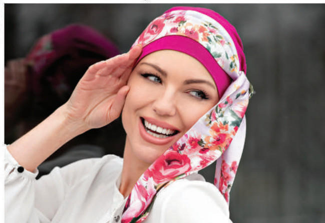
YANNA Purple Camellia