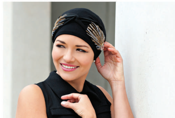
CAROLINA Black Golden Laurel Crown