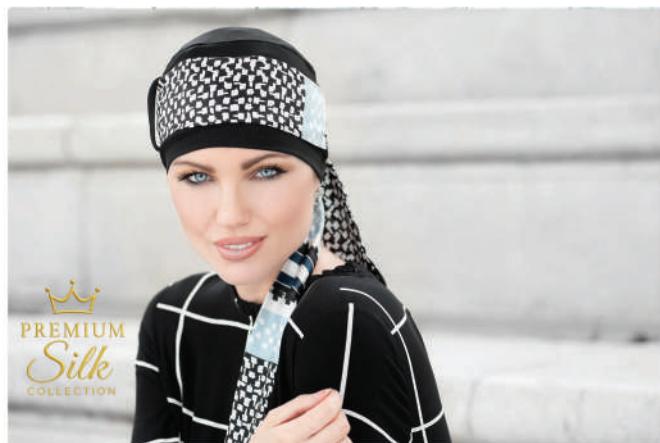
YANNA Silk Black Midnight Pearl