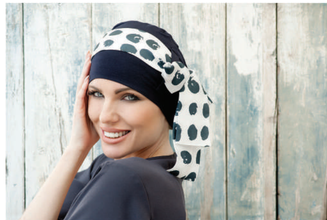
YANNA Navy Polka Dot