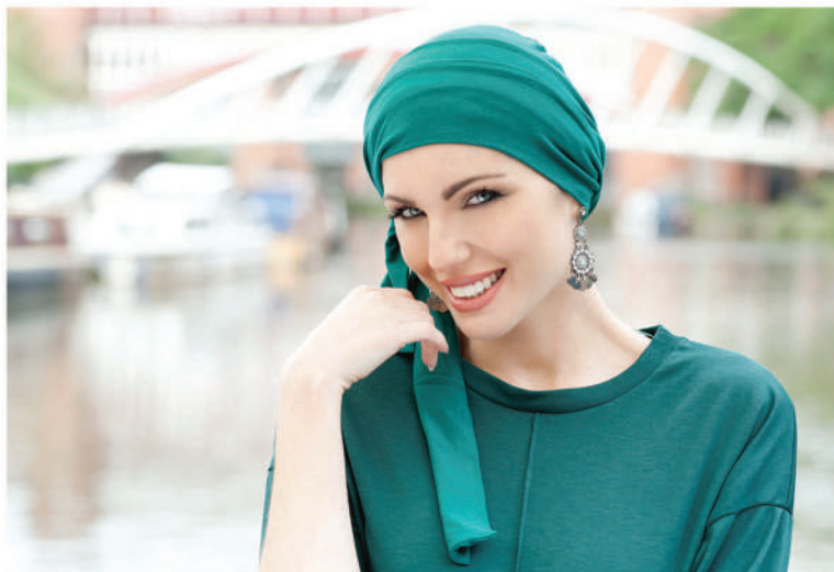
ASHA LOOK | 1 Green Forest