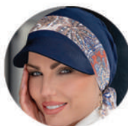
Navy Mosaica Linea