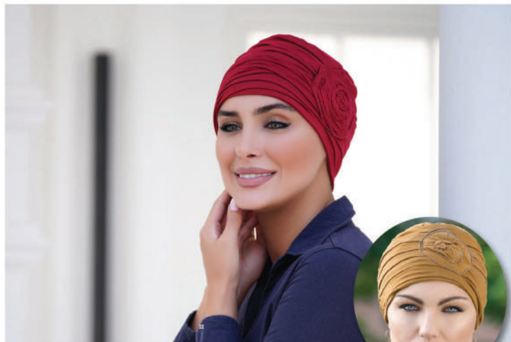
PRIMROSE Red Rose