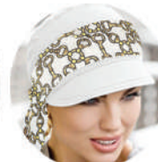
White Golden Chain