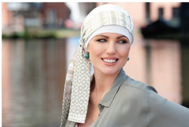
YANNA White Green Aloe