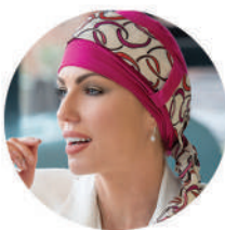
YANNA Purple Cerchio Elegant