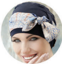
YANNA Navy Mosaica Linea