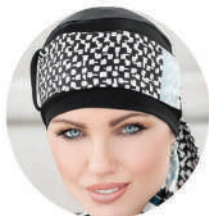
YANNA Black Midnight Pearl