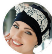
YANNA Navy White Lilium