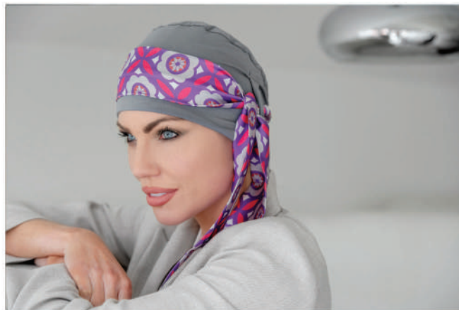
YANNA Grey Purple Rose