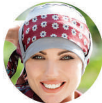
YANNA Grey Maroon Fiori