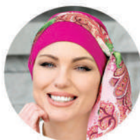
YANNA Purple Royal Fuchsia