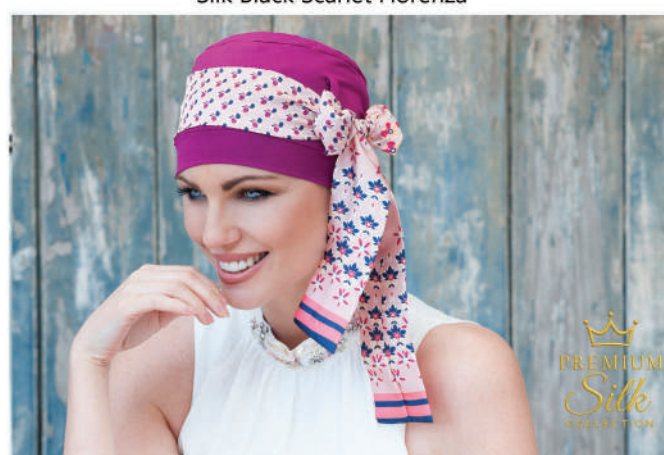
YANNA Silk Purple Blush Florenza