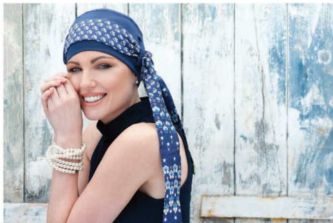
YANNA Navy Iris Florenza