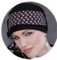
YANNA Black Scarlet Firenze