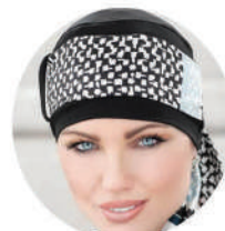
YANNA Black Midnight Pearl