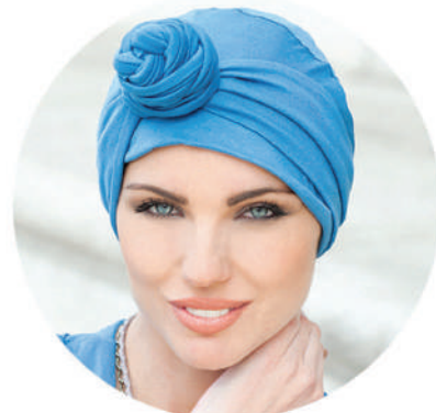
ASHA LOOK | 3 Blue Ocean