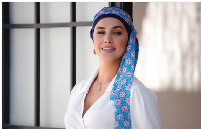
YANNA Navy Sky Flora