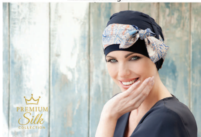
YANNA Silk Navy Mosaica Linea