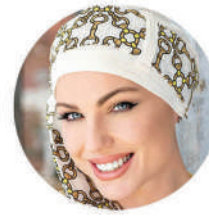
YANNA White Golden Chain